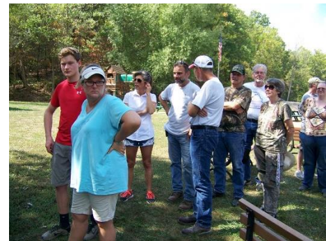
Picnic lunch line