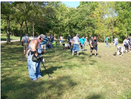
Cash payout hunt