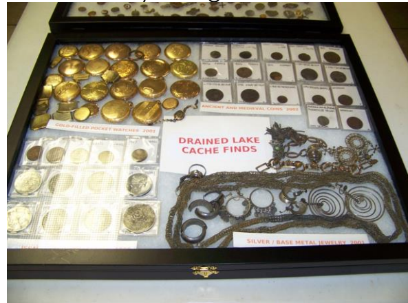
Drained lake cache finds