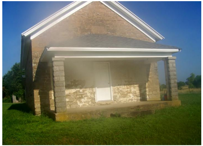
Oak Grove School, Parsons, KS-1877